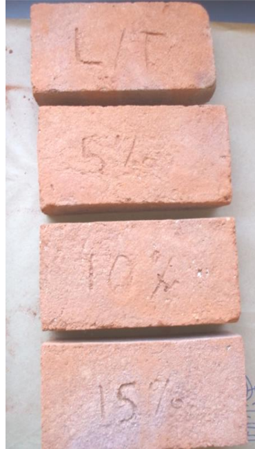
Figure 1. Photograph showing some sintered bricks.

Figure 2 shows the results of XRD of the samples studied in this work. According to the XRD patterns obtained, the only crystalline phases present in the samples are albite and silicon oxide. It can be seen that as the amount of glass samples is increased, the amount of silicon oxide decreases and albite phase. The decrease in peak intensity of silicon oxide phase indicates that the material becomes amorphous as the glass amount added increases.