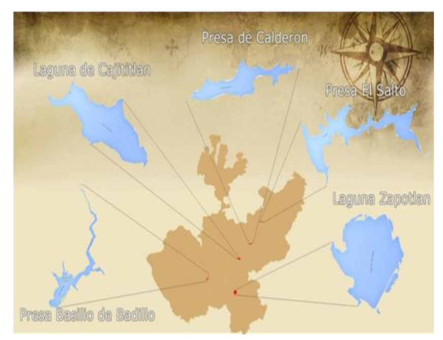
Figura 1. Área de estudio (localización de los cinco cuerpos de agua)

The five bodies of water in the study area are located in the VIII Lerma-Santiago-Pacific hydrological region, in the Armería-Coahuayana hydrological subregion (figure 1). This area is constituted by two natural lakes (Zapotlán and Cajititlán, whose characteristics are endorheic) and three artificial reservoirs or dams (Basilio Badillo, Calderón and El Salto, with exorreic characteristics). The comparative study was considered relevant, since they are satellite bodies of water from the Lerma-Chapala-Santiago and Ayuquila-Armeria regions, indicated as priorities for requiring urgent measures to recover their ecohydrological functioning (Cotler, 2010).